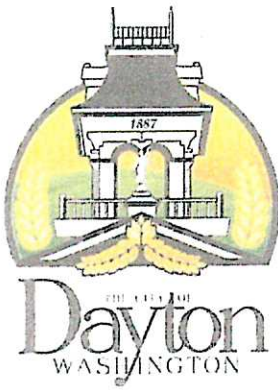
Exhibit "A" Resolution No. 1365 12/19/2018

City of Dayton 111 S. 1st Street, Dayton, WA 99328 Office 509.382.2361 Fax 509.382.2539 Web \Vww.dayton.wa.com