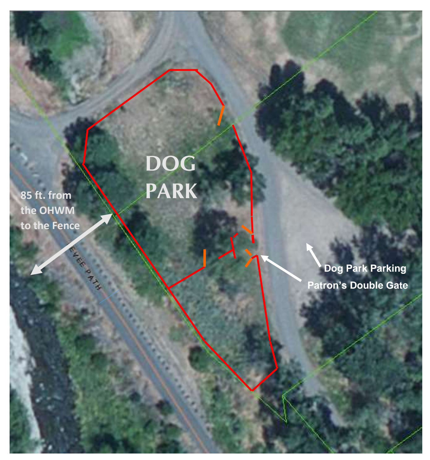
RED marks the proposed fence and ORANGE marks the location of gates.

A double entry for access by patrons and two maintenance gates are proposed