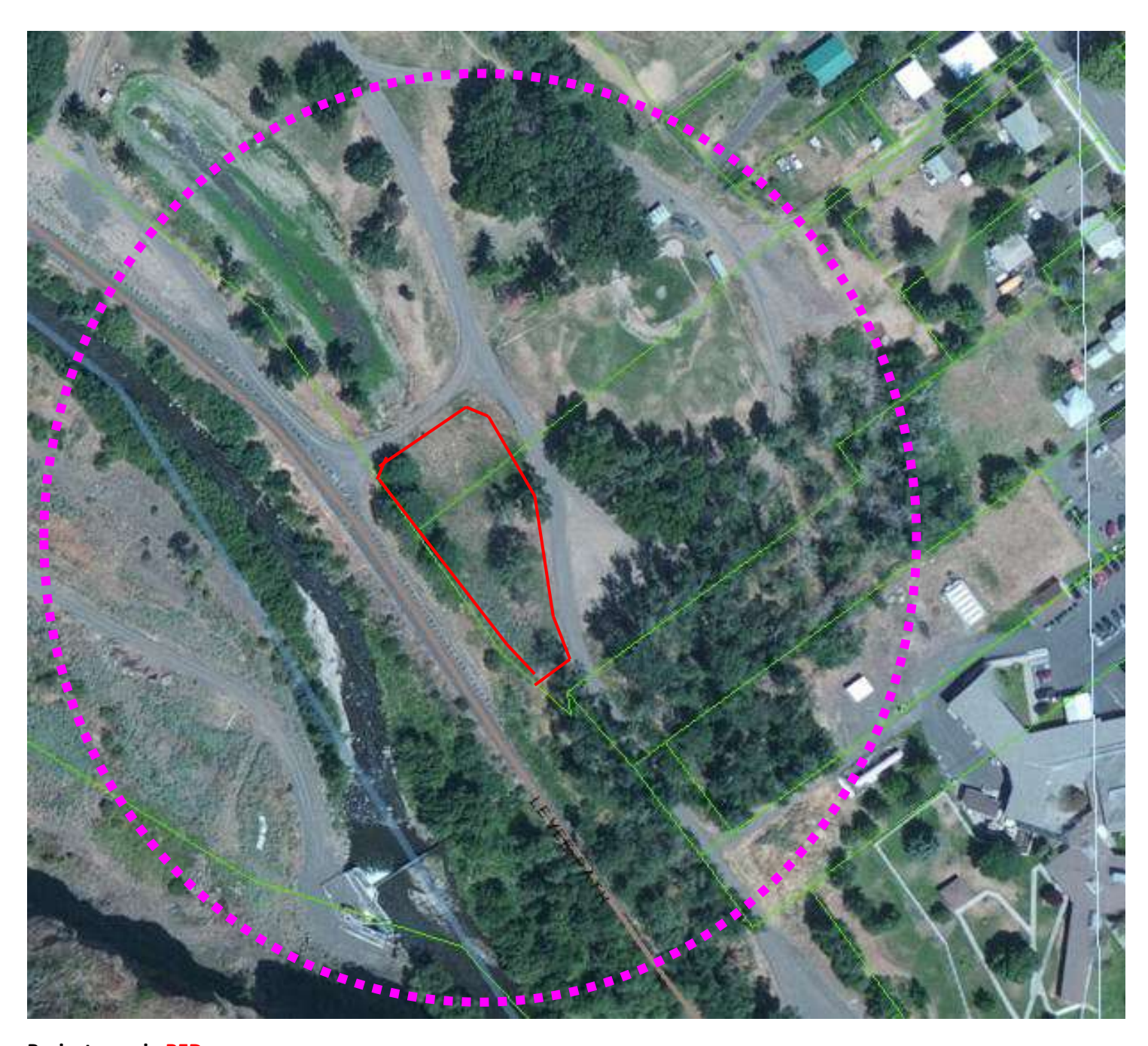
Project area in RED