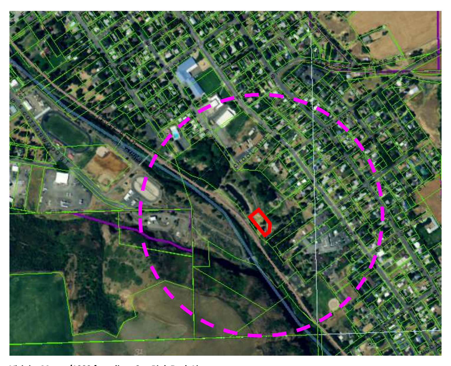
Vicinity Map w/1000 ft. radius. See Pink Dash Line