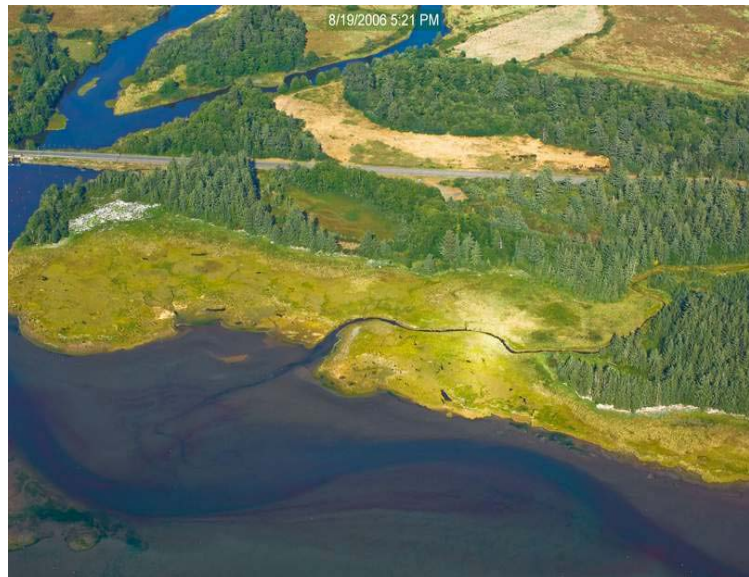
Figure 1. Shoreline master programs should address wetlands like these along Baker Bay in the Columbia River.

After Ecology approves the updated or new SMP or segment amendment, the SMP alone will provide protection for critical areas within shoreline jurisdiction. This transfer of authority occurs immediately with Ecology approval. At that point, you will no longer use the CAO for critical areas planning or regulatory purposes within shoreline jurisdiction. This was clarified by legislation adopted in 2010. See Ecology's web page on this bill (EHB 1653) at http://www.ecy.wa.gov/programs/sea/sma/news/reconsider.html for more information. (Adopting or updating a CAO that will apply outside shoreline jurisdiction is not a comprehensive or segment SMP update and does not require Ecology approval.)