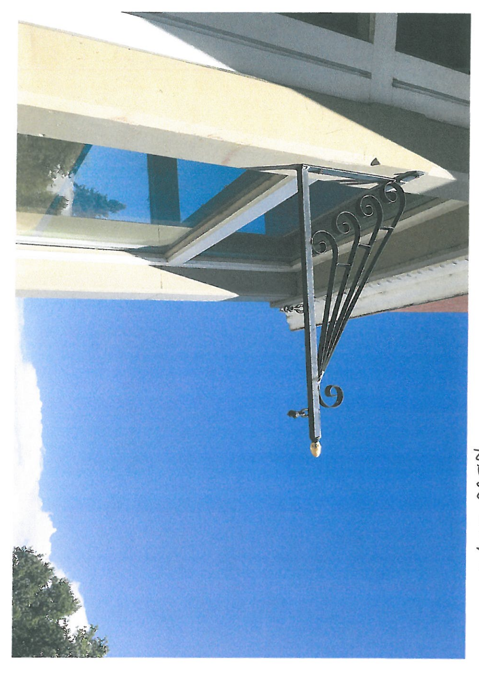
NEW STYLE BRACKET - PREVIOUSLY APPRILED